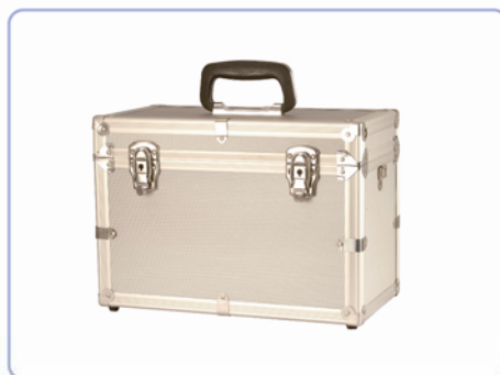
◆ Carrying Case