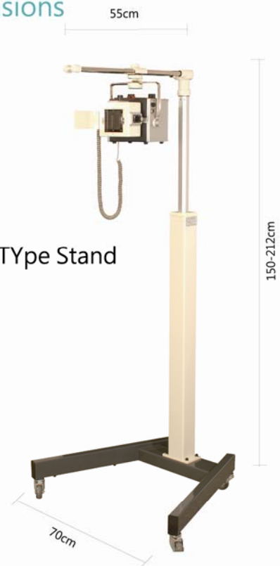
◆ A-TYPE Stand